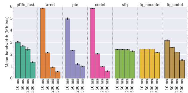
Figure 2: RTT fairness results. The graphs show the aggregate mean goodput of each of the four TCP flows for each queue management scheme.

Figure 2 shows an example of the results against the same set of queue management schemes as the RRUL test above, run against four endpoints with path RTTs of 10, 50, 200 and 500 ms, respectively. The figure shows the mean goodput of each of the four TCP streams for each of the queue management schemes.